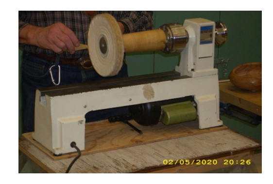
Outside polisher attachment.

Meeting Adjourned at 2050 Next meeting, March 4<sup>th</sup> 2020.