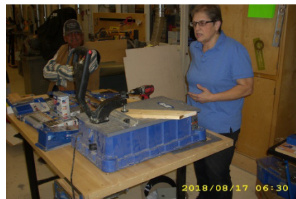
The jig table system is demo'd.