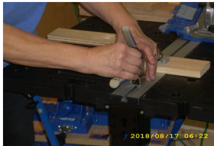
Clamping system on Kreg work-table