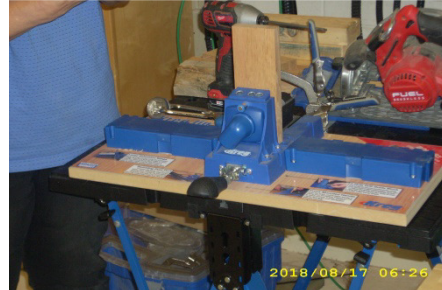
Large jig used in construction