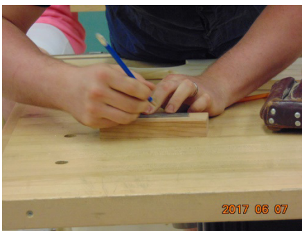
Laying out bow-tie