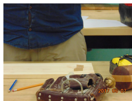
Fitted & glued into finished hole