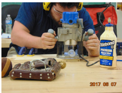
Router roughs-out hole