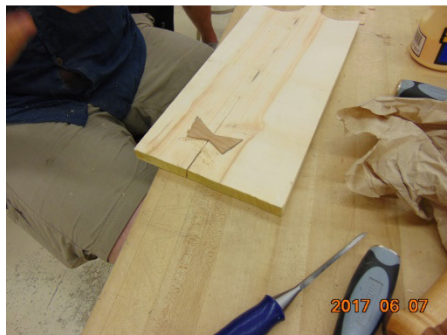
Just needs planing flush