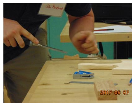
Fine finish with chisel