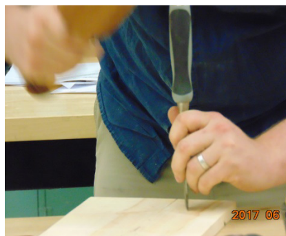
Matching hole cut into board