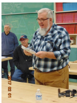
Finer points of making...