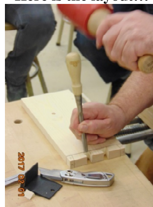
Chisel to finish joints...