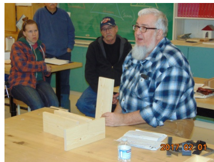
Here is the layout...