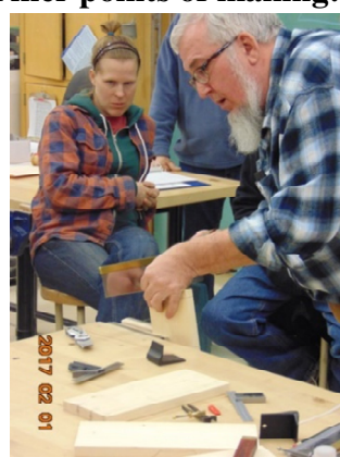
Opposite for sides from ends..