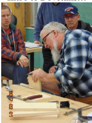
Layout & sawing...