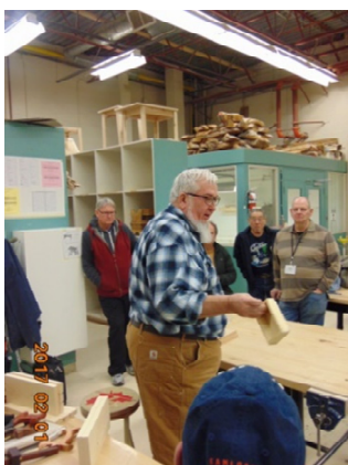
Intro to Dovetails...