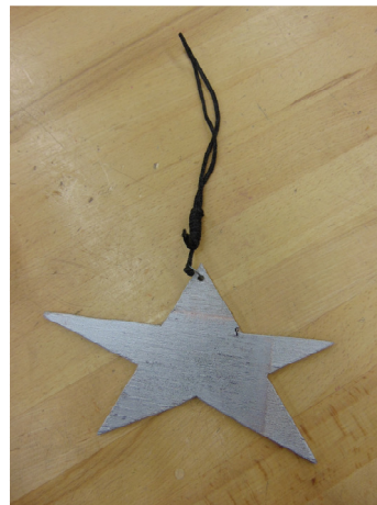
Russ' Silver Star for attendance...