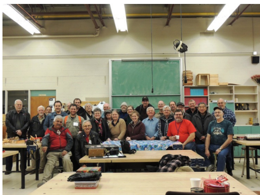
Here's the crowd at the December meeting.