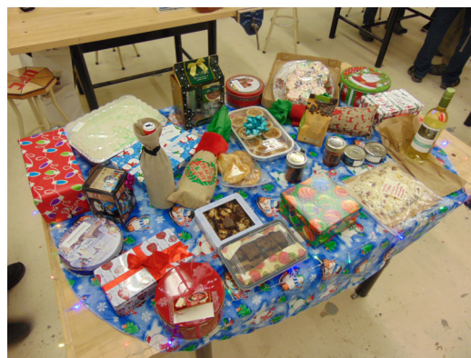
Here is a sampling of what was won.

MERRY CHRISTMAS AND A HAPPY NEW YEAR TO ALL!