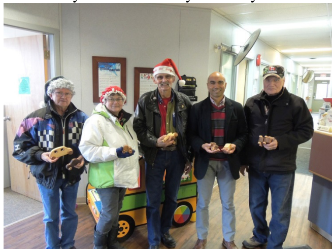
Toymakers at Interior Community Services