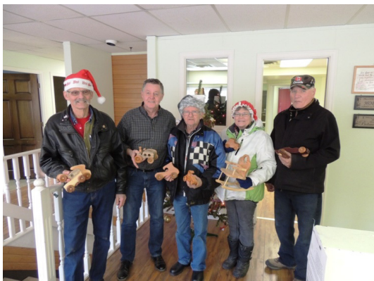
Toymakers at New Life Community Ctr.