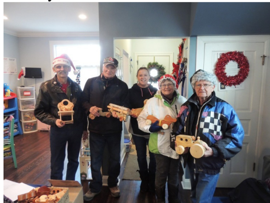
Toymakers at Family Tree Daycare