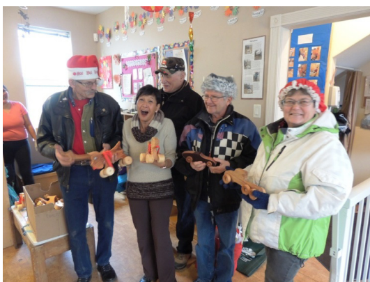
Toymakers at Early Learning Center