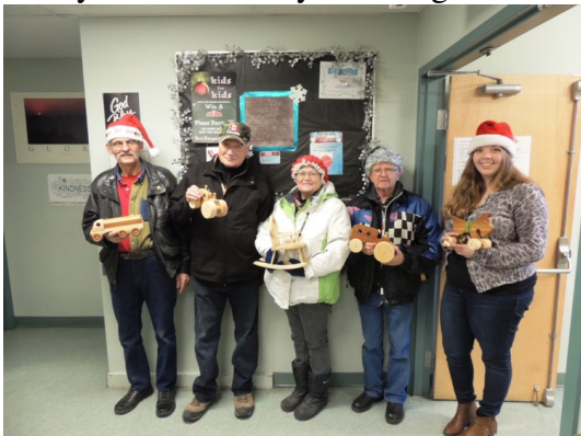
Toymakers at the Salvation Army Ctr.