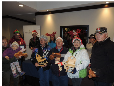
Toymakers at RIH