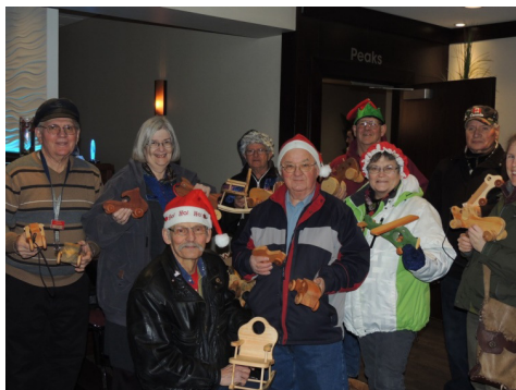
Toymakers at Christmas Amalgamated