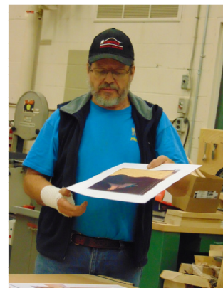
Past onto paper