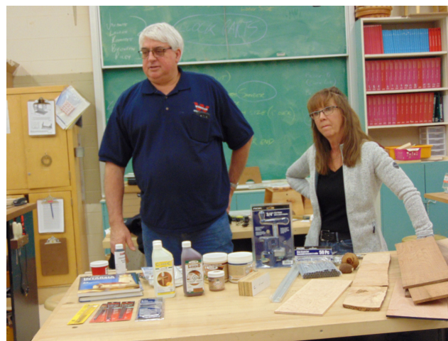
Selection of finishing items