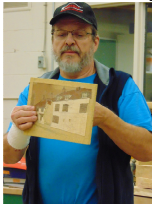
Match wood grains