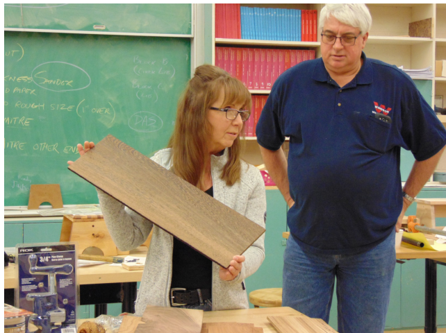
Selection of different woods