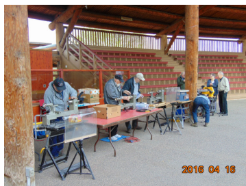
Setting up Demo tools