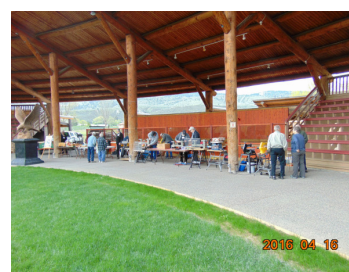
Our area in the arbour