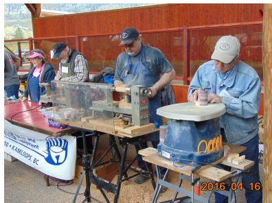
Busy, busy, busy