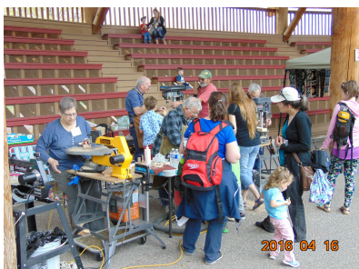
Toy makers were busy