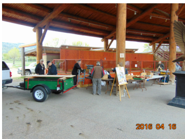
Setting up Sales table