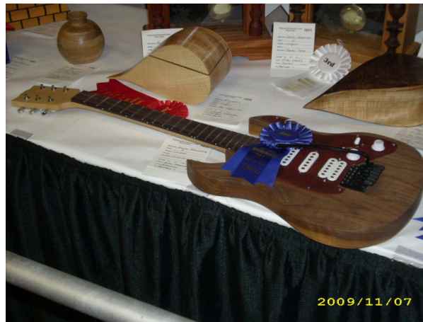
2009 People's Choice - Student