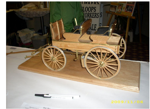
2009 People's Choice Overall Winner