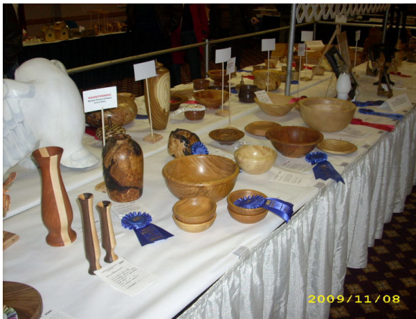
Turning entries from 2009's show.